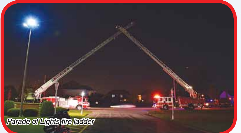
Parade of Lights fire ladder

South Holland Fire Department is taking a positive approach to connecting with the community as firefighters and department leadership. In October, the department held the annual Fire and Rescue Ceremony and Parade of Lights at Thorn Creek Church, and hosted an open house at Fire Station 1. In early November, the department hosted its first Coffee with the Firefighters at Fire Station 1. As the department plans to continue with this new initiative, Coffees will be held the first Saturday of every month, from 8:30 to 9:30 a.m. The next two Coffee with the Firefighters are Saturday, December and January 3.