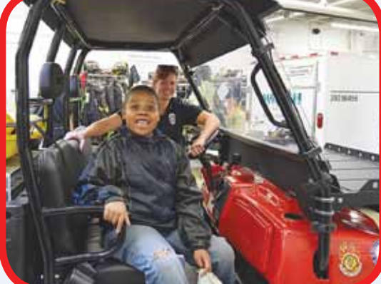
SHFD hosted an open house at Fire Station 1